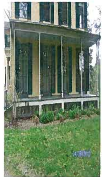
Emily Dickinson's Home Amherst, MA Lived 1830-1886